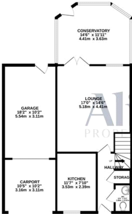
GROUND FLOOR 866 sq.ft. (80.5 sq.m.) approx.