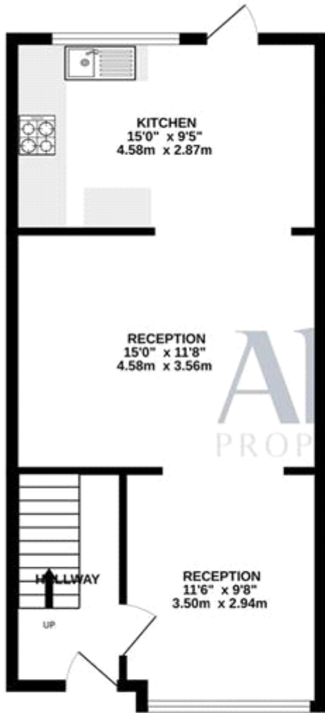
GROUND FLOOR 483 sq.ft. (44.9 sq.m.) approx.