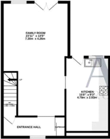
GROUND FLOOR 1,339 sq. ft. (124.3 sq. m.) approx.