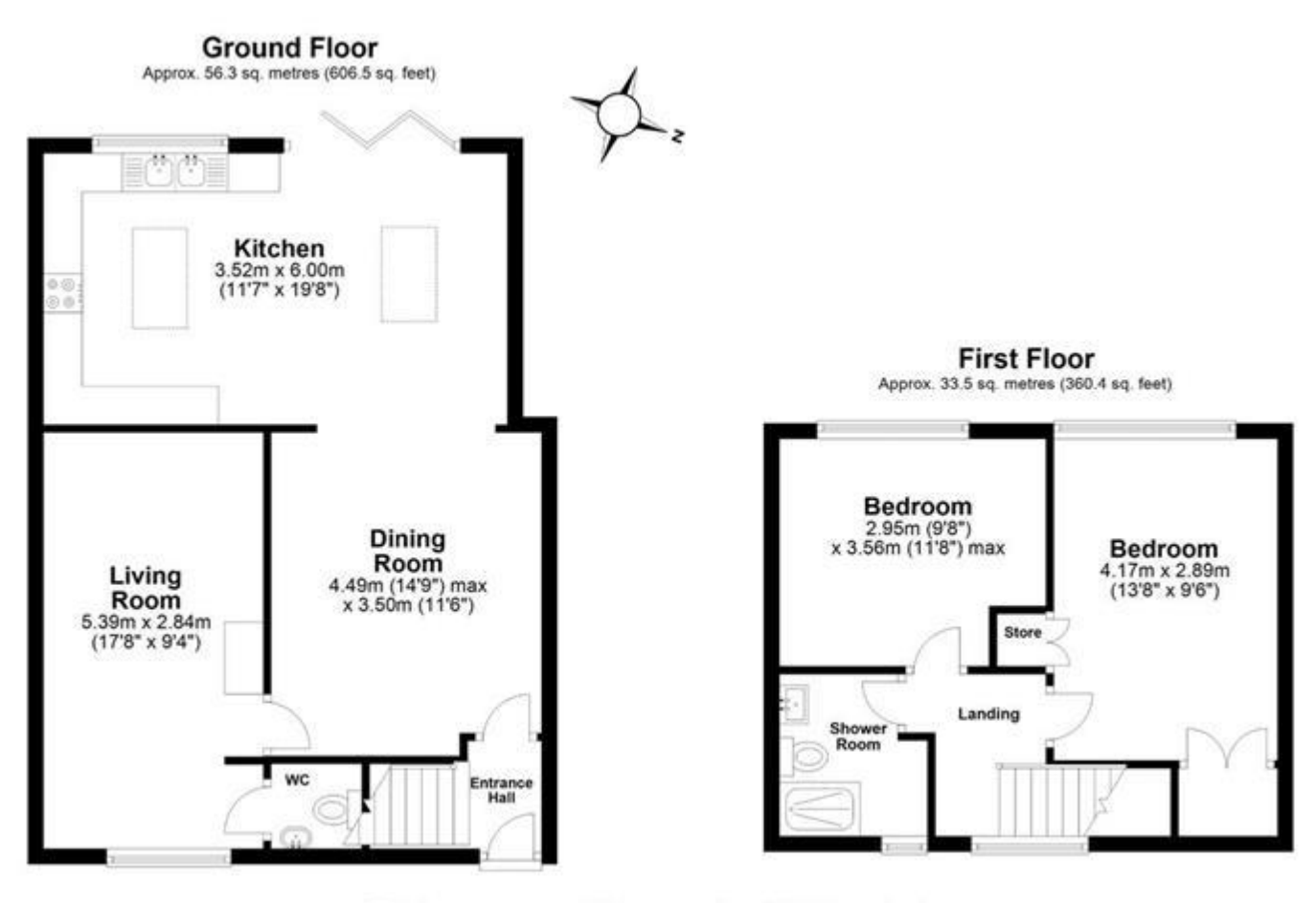
Total area: approx. 89.8 sq. metres (966.9 sq. feet) Silvertown Avenue