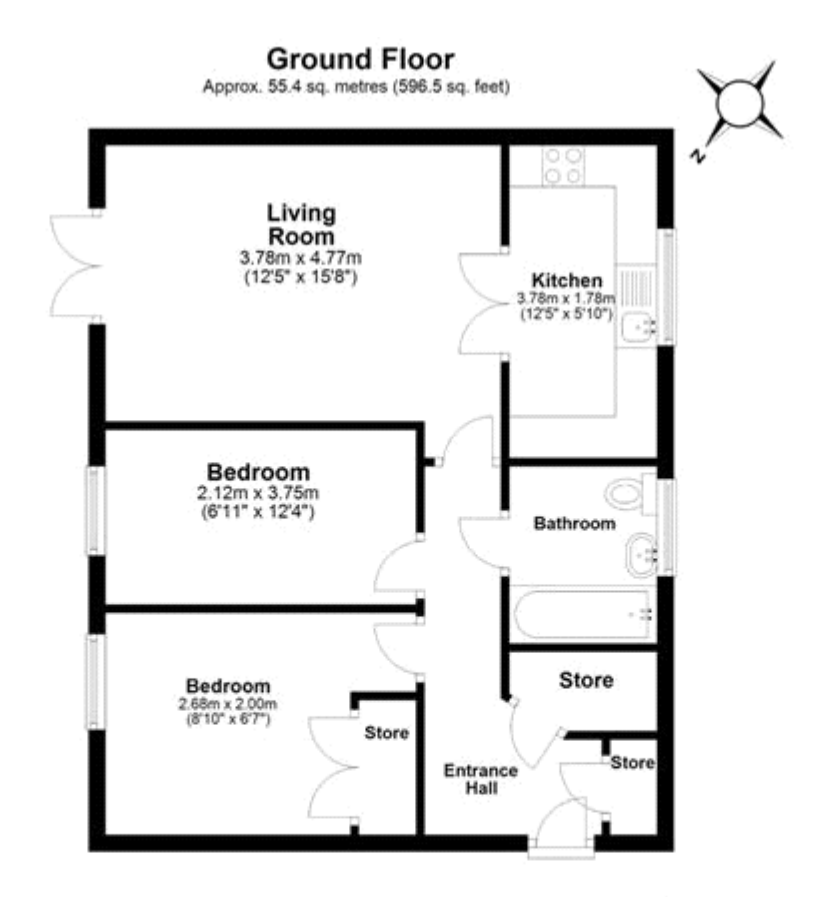
Total area: approx. 55.4 sq. metres (596.5 sq. feet)

All measurements have been taken as a guide to prospective buyers only and are not precise. This plan is for illutrative purposes only and no responsibility for any error, ommison or misstatement. The services, systems and appliances shown have not been tested and no guarantee as to their operability or efficiency can be given. Measurements may have been taken from the widest area and may include wardrobe/cupboard space. No guarantee is given to any measurements including total areas. Buyers are advised to take their own measurements. Plan produced using PlanUp.