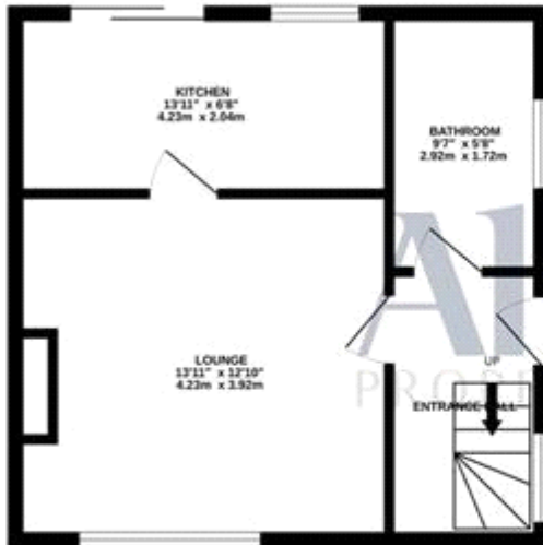
1ST FLOOR 382 sq.ft. (35.5 sq.m.) approx.