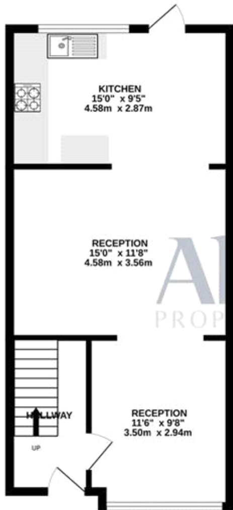
GROUND FLOOR 483 sq.ft. (44.9 sq.m.) approx.