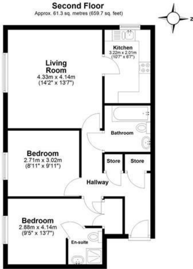
Total area: approx. 61.3 sq. metres (659.7 sq. feet) Frobisher Gardens