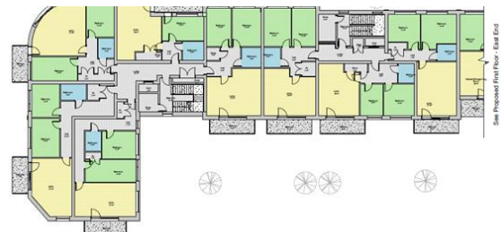
PROPOSED FIRST FLOOR - WEST END 1:100