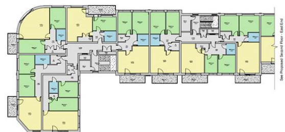
PROPOSED SECOND FLOOR - WEST END 1:100