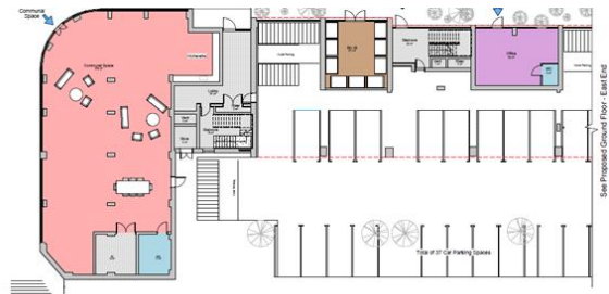
PROPOSED GROUND FLOOR - WEST END 1:100