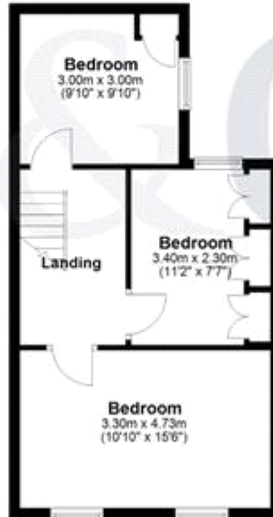
First Floor Approx. 39.2 sq. metres (421.6 sq. feet)